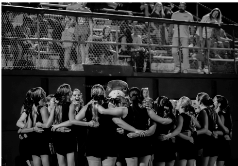
Cheer team discussing their next cheer to support the team.