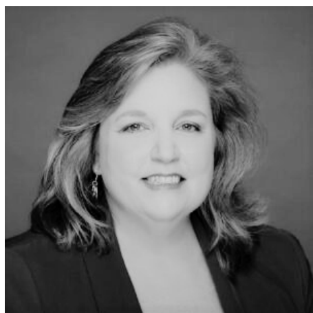
Successful journalism alumni returns to DHS