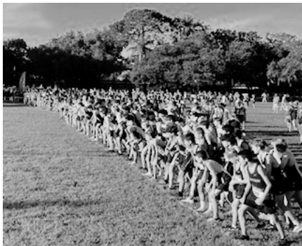
Runners lining up at the 1st annual Todd Howsare Falcon X Invitational